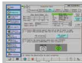
Operation guidance indication