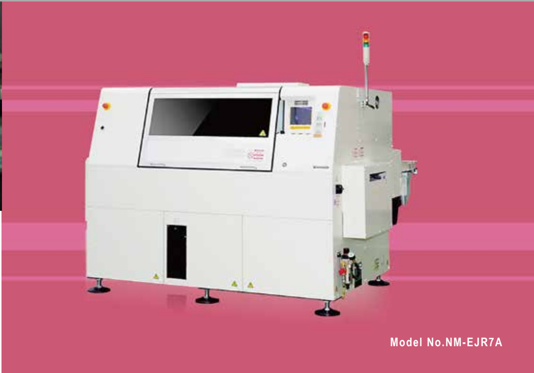
Model No. NM-EJR7A