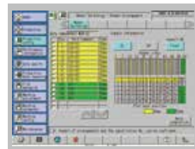
Setup support function